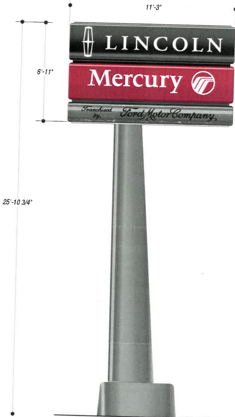
75 SF Sign shown with P20 Column